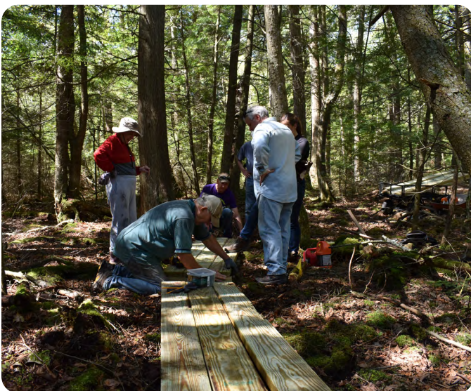
Logan Creek Workday