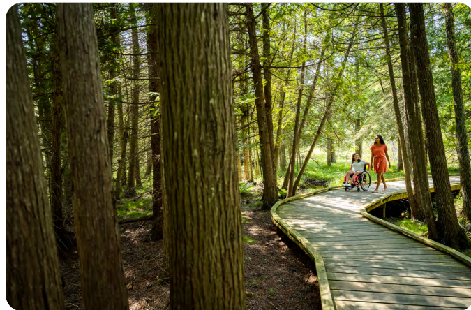
Hidden Brook Boardwalk