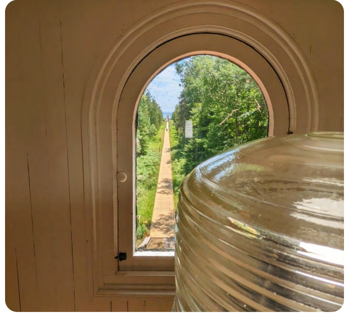
Range Light Corridor

The Ridges honors its history of accessible and impactful conservation education through Lake Lessons. These evening programs feature topics about the Great Lakes and surrounding habitats by experts from around the Midwest. All programs are free and donations are appreciated! Pre-registration is requested due to limited space.