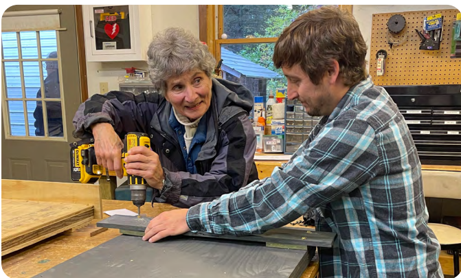
Bat House Workshop