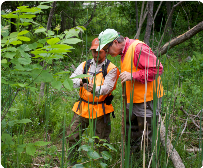
Invasive Species Workdays