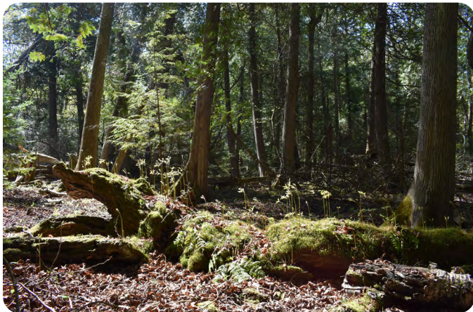
Appel's Bluff Hikes