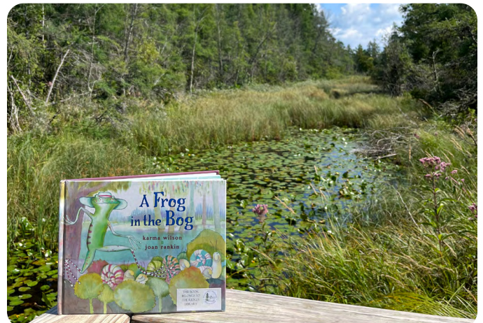
Family Story Hour

Location: Family Discovery Trail, 8297 Hwy 57, Baileys Harbor