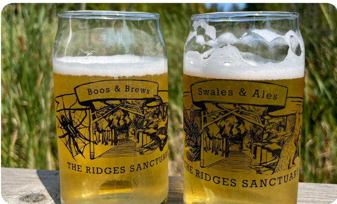
Swales & Ales / Boos & Brews