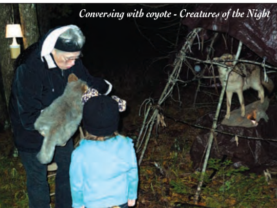
Conversing with coyote - Creatures of the Night

Our No Family Left Inside programs are held monthly during the school year and weekly from mid-June through mid-August.