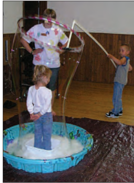
Inside the giant bubble - Family Discovery Night

Hands-on activities involve both parents and children in learning about topics like “Signs of Spring,” “Monarch Magic” and “Survival.” Activities like Geocaching and Winter Games are more recreation-oriented. This program is a co-