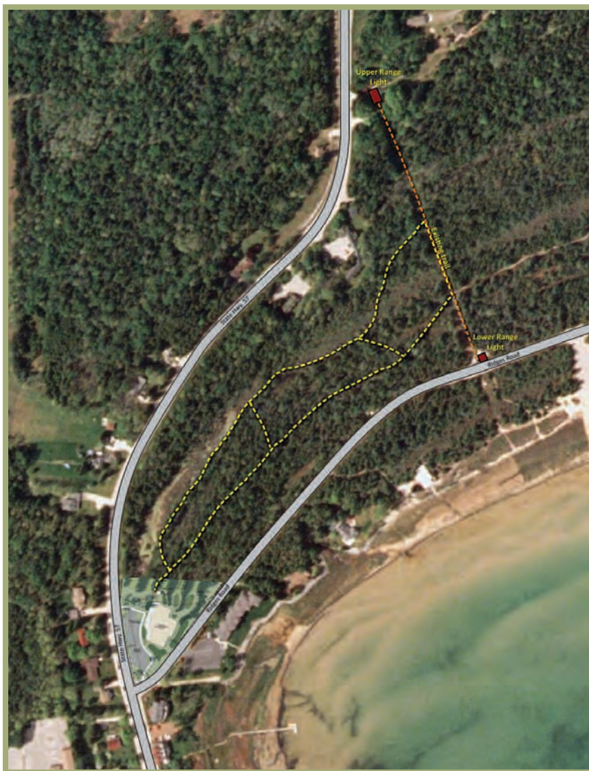
Hidden Brook Trail system