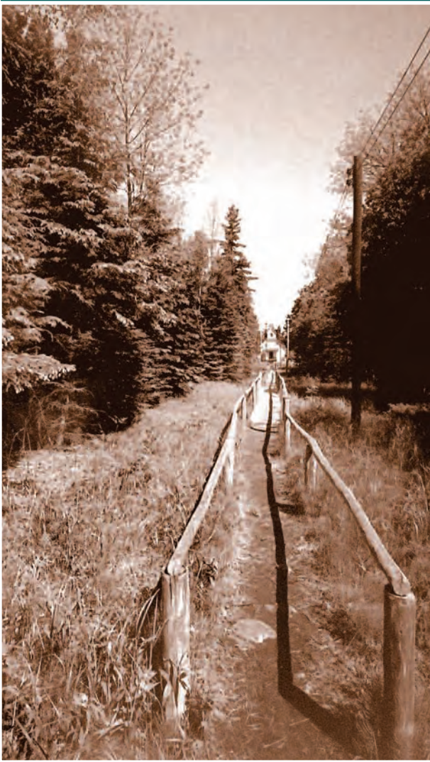
The area was saved from development by the presence of the Bailey's Harbor Range Lights.