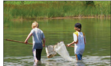
Sneaking up on those “Skittering Critters”