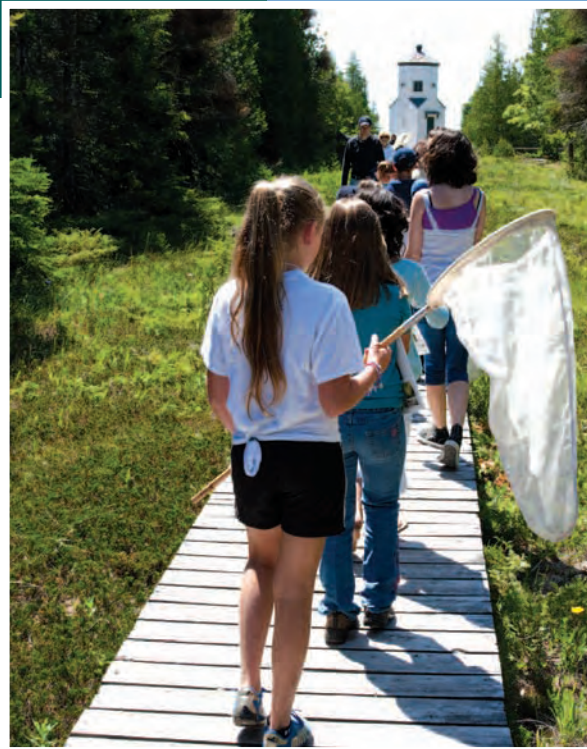
Summer Campers butterfly hunting