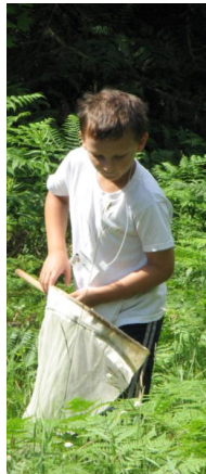
front cover—Getting kids outdoors exploring nature is the purpose of our No Family Left Inside program