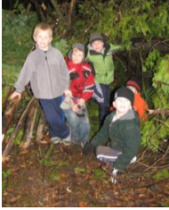
page 9—Young adventurers show off their Survival shelter (A No Family Left Inside program)