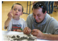
front cover—The Family Discovery Night in late June is a time to explore owl pellets, water critters, land bugs, and step into the Giant Bubble!