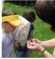
page 4—summer campers stare back into the eyes of a dragonfly