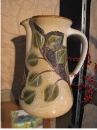
page 9—One of the many extraordinary pieces of art at the Reading the Ridges exhibit at the Link Gallery in March 2010