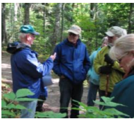
page 7—Learning from the experts is the order of the day for the Wisconsin Naturalist classes held each Fall