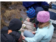
page 5—Looking for Signs of Spring (a No Family Left Inside program)