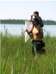
page 8—On a hunt for dragonflies at the July dragonfly workshop