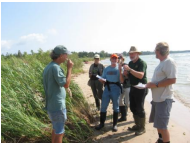
page 7 & front cover—The Barberry Pirates checking out the palatability of Phragmites shoots