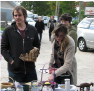
page 6—Checking out the bargains at The Ridges' Flea Market in September