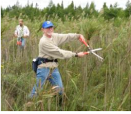
page 9—Barberry Pirates attack phragmites at Pickerel Pond