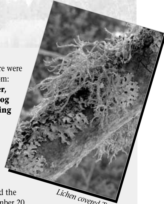
Lichen covered Tree

● A walk through the woods on December 15 revealed plenty of animal tracks, including mouse tracks in and out of the Nature Center.