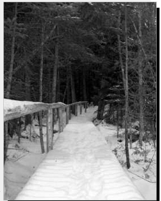
Mountain Maple Trail bridge