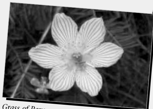
Grass of Parnassus - unusual 6-petalled flower

● By the end of October, the Chickadees and Nuthatches had already stashed away over 200 lbs. of sunflower seed!